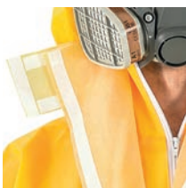
Self-adhesive chin flap