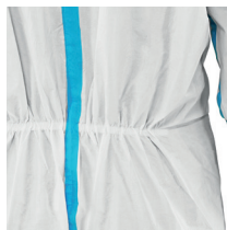
Elasticated waist (glued-in)