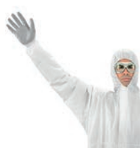
Maximum comfort and ergonomics