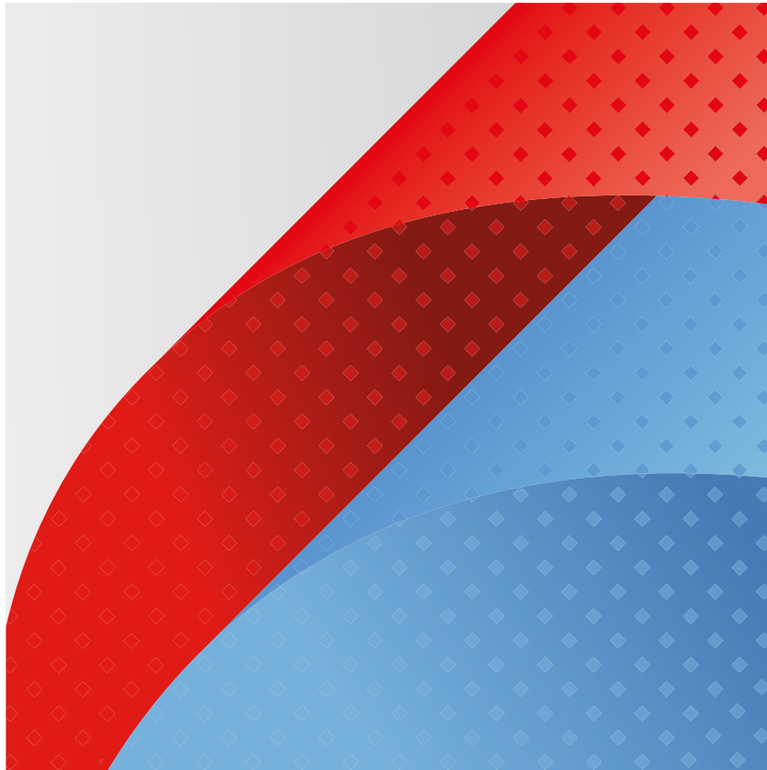
PP Spunbond Monocomponent