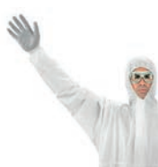
Maximum comfort and ergonomics