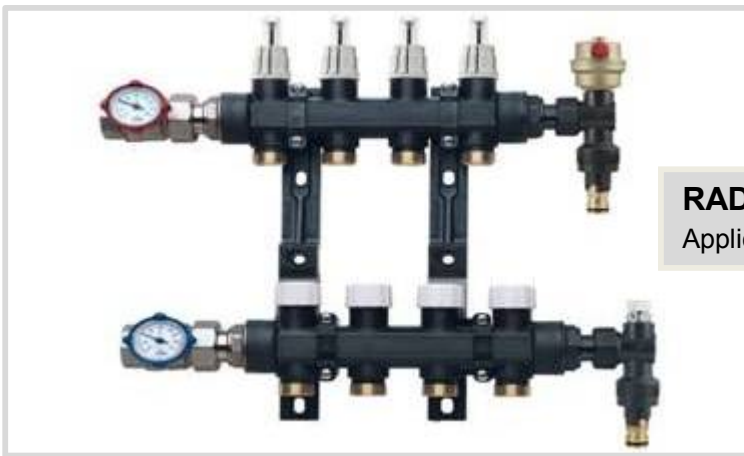
RADILON® A RV300RKC

RADILON® D RKC PA 6.10 specialties are ideal replacements for brass or speciality polymers (PPA and PPS) for the manufacture of plumbing fittings, valve components, taps and other parts in continuous contact with water.