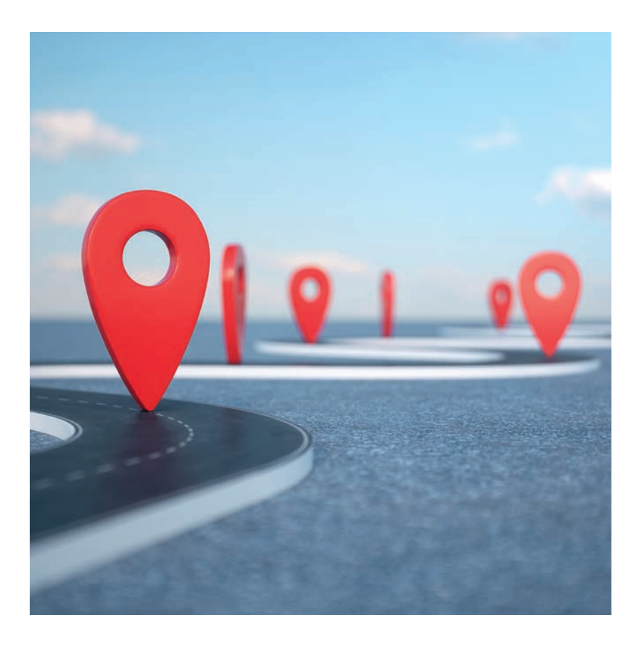
Discover the journey